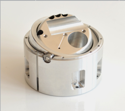
Geophone Gimbal Unit