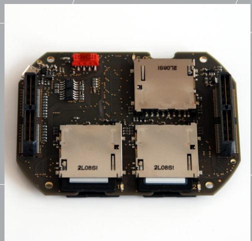
develogic OBS.Vault Storage