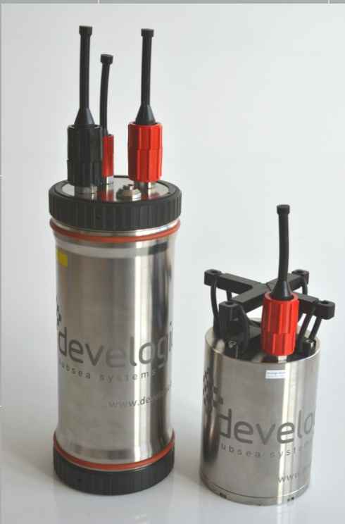
OBS.Vault with fully gimbaled Geophdevelopic