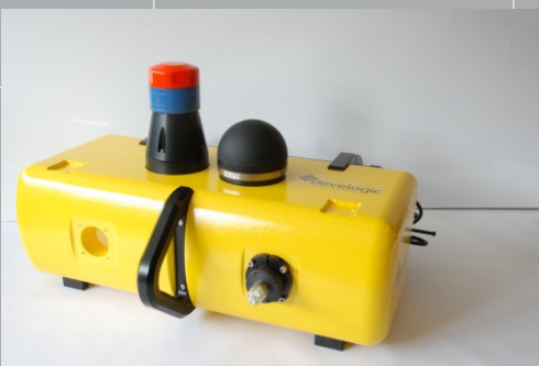
develogic Modular Seafloor Lander MSL.3000/6000