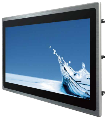
Real Flat Panel Mount (IP65 front side)